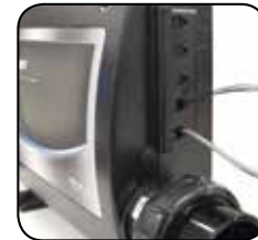
SYSTEM SIDE VIEW

After the Gateway Ultra Spa module is inserted, gently pull on the wire to make sure the clip is securely in place and will not come loose.